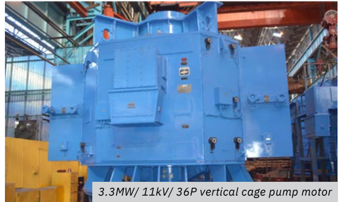
3.3MW/11kV/36P vertical cage pump motor