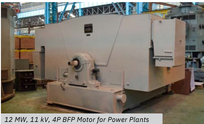
12 MW, 11 kV, 4P BFP Motor for Power Plants

Motors are provided for entire gamut of power plant applications covering various types of fans, compressors, conveyors, crushers, mills, pumps etc. in the range of 150 kW to 22,000 kW.