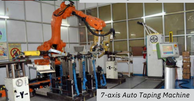
7-axis Auto Taping Machine