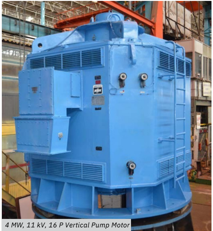
4 MW, 11 kV, 16 P Vertical Pump Motor