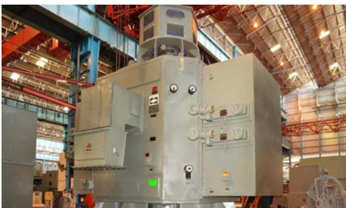
5.2 MW, 11KV, 372 RPM Vertical Syn Motor for Lift Irrigation

Slow speed vertical synchronous as well as asynchronous motors with high thrust bearing capability of 130 T can be offered upto 15 MW in speed range 167- 1000rpm.