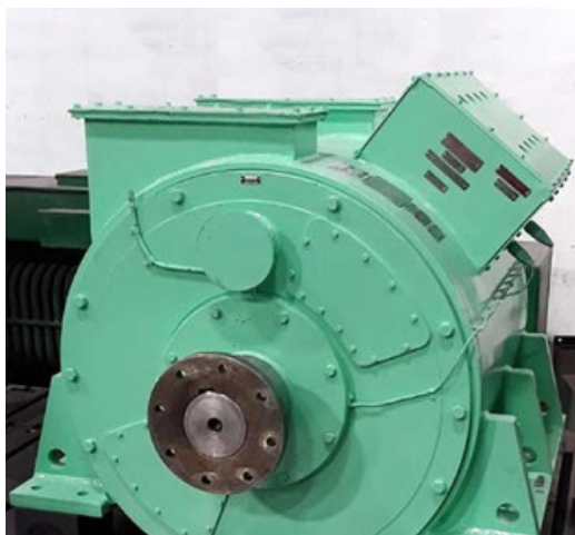
Permanent Magnet Reserve Propulsion Motor