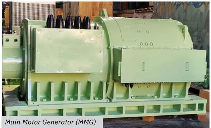
Main Motor Generator (MMG)