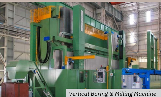
Vertical Boring & Milling Machine