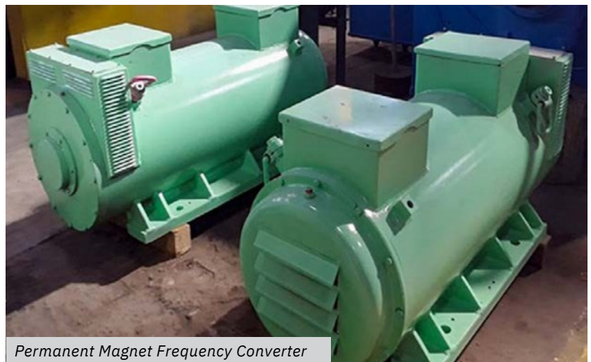
Permanent Magnet Frequency Converter