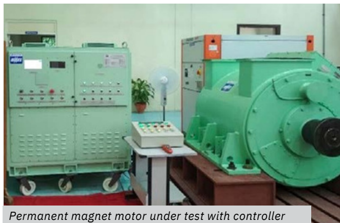
Permanent magnet motor under test with controller

BHEL motors are tested in accordance to applicable BIS/IEC/NEMA/ IEEE standards.