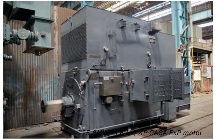
5.8MW/6.6kV/4P CACA EXP motor

Special motors are offered for primary and secondary side of nuclear power plants and strategic applications of defence i.e. MMG, permanent magnet based frequency converters and reserve propulsion motors. BHEL has supplied motors for critical applications like 6 MW PCP & 10.7 MW BFP for Nuclear power projects