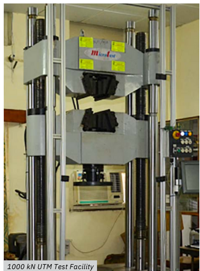
1000 kN UTM Test Facility