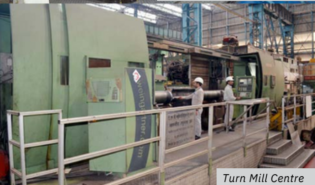
Turn Mill Centre